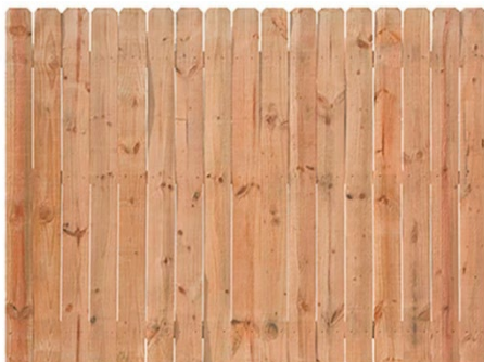
(Smooth finished side shall face outward from the yard)

Helpful tips for your site plan and application to help avoid delays in processing: