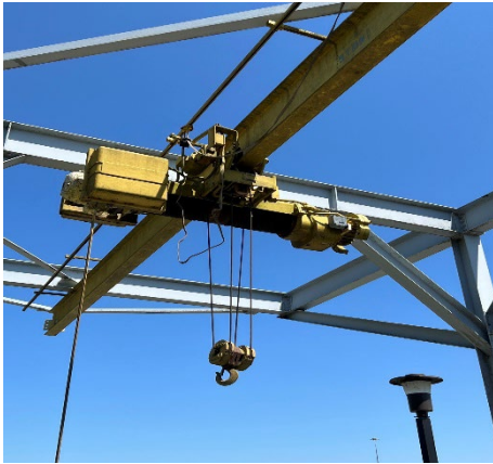
Exhibit 1. Effluent Filter Building Crane